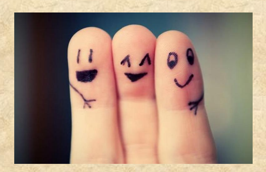
Rule No. 3 Be a real friend

If we ask someone to jot down the virtues or traits of character that they most want to see exhibited in their best friends. Invariably traits like loyal, kind, faithful, fun-loving, optimistic, enthusiastic, and trustworthy head the lists. It will probably come as no surprises to you that they just given a pretty fair description of the family dog.