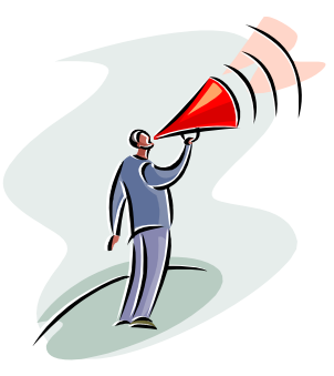
Leaders need to be seen and heard.