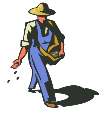
"He Prized the Seed Rather than the Bouquet." (p. 70)

Know the goal and set the standard high. Do not let short term gain be the main goal. Focus on planting seeds that will continue to provide returns and ensure long term viability.