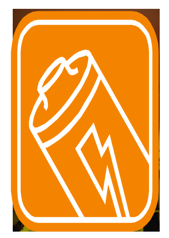
"Jesus guarded his energy." (p. 24)

when there are doubters. Others may question you, but you must believe in your self. This challenge takes energy and you must recognize what negative influences draw your energy out. Without energy we cease to move forward. We must avoid energy leaks and take time to replenish our reserves.